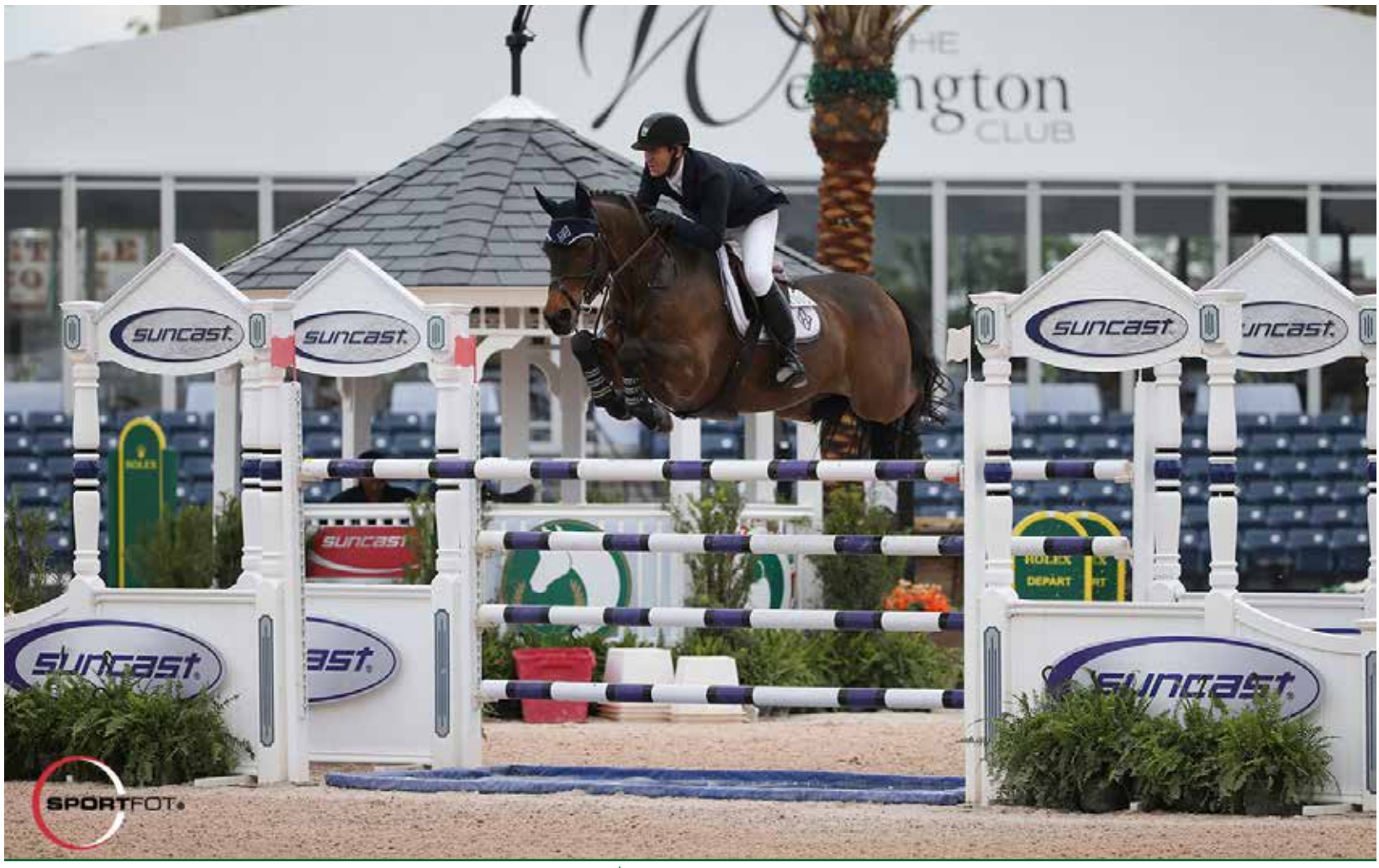
McLain Ward and HH Carlos Z were the $130,000 Suncast® 1.50m Final winners.

McLain Ward and HH Carlos Z Capture $130,000 Suncast<sup>®</sup> 1.50m Championship Jumper Series Final; Shane Sweetnam Leads 2016 Series Overall