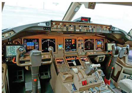
Figure 1.1. Cockpit of Boeing 777.

Another area of major impact of modern avionics is the cockpit and pilot vehicle interface. In earlier aircrafts, there were a large number of mechanical and electromechanical instruments in the cockpit which were difficult to read which increased the pilot's workload. In modern avionics systems, information from all aircraft systems and sensors are available in real time. This has enabled the introduction of 'Glass Cockpit' with programmable large LCD multi function displays which provide the pilot with any information he needs at the touch of a button/icon. Electronic Flight Instrumentation System (EFIS) increases the situation awareness (both external and internal) of the pilot and reduces his workload. In fact integrated avionics system with glass cockpit and increased automation has enabled the reduction of crew in the cockpit of large long distance passenger aircrafts from four to two. Avionics enables extensive automation of many of the pilot's functions and improves the safety of the aircraft by giving early warning of faults in any system or navigation errors or adverse weather conditions. A typical glass cockpit of a civil aircraft (Boeing 777) is shown in Fig. 1.1.