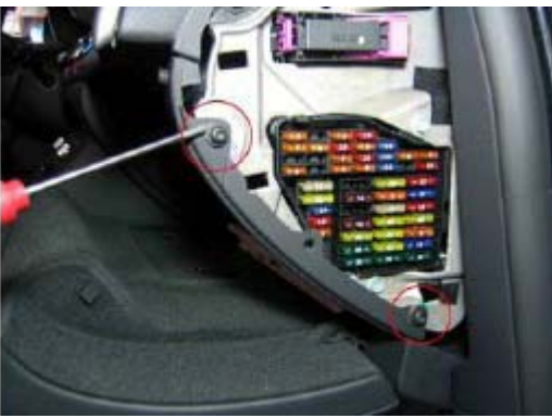
Step 3 Remove the following screws to release the CD changer,