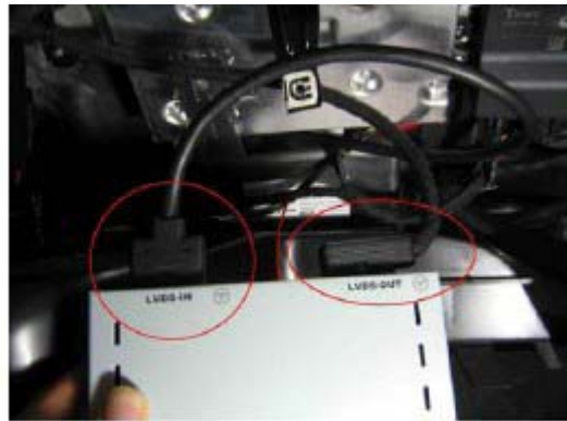
Step 7 - MMI CONECTION

The interface can be connected to the MMI system to allow you to select Video source via MMI controls.