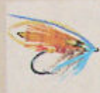
RWFF Durham Ranger