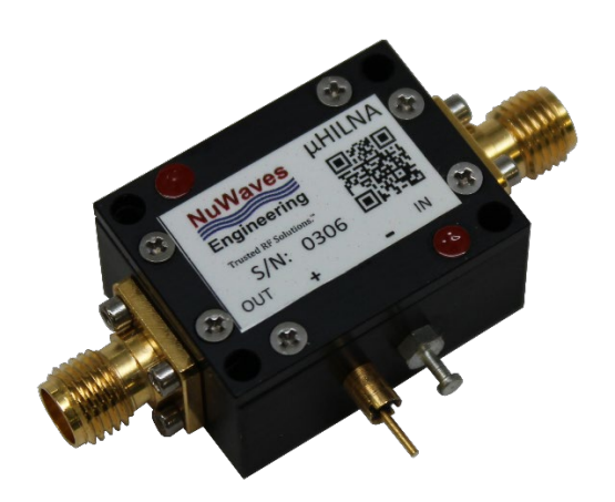
Figure 1. NuWaves' µHILNA<sup>™</sup> Low Noise Amplifier (LNA) operates from 50 to 1500 MHz, delivers 20 dB of gain, with less than 1 dB of Noise Figure (NF) and a Third-Order Intermodulation Product (IP3) of +31 dBm.

Although passive components contribute some noise to a signal path, this document will only deal with the NF of amplifiers and chains of amplifiers. This understanding will then be used to demonstrate the improvement in receive quality from adding a low noise amplifier (LNA) to the antenna input (i.e., front end) of a receiver, such as the NuWaves µHILNA<sup>TM</sup>LNA described in this Application Note.