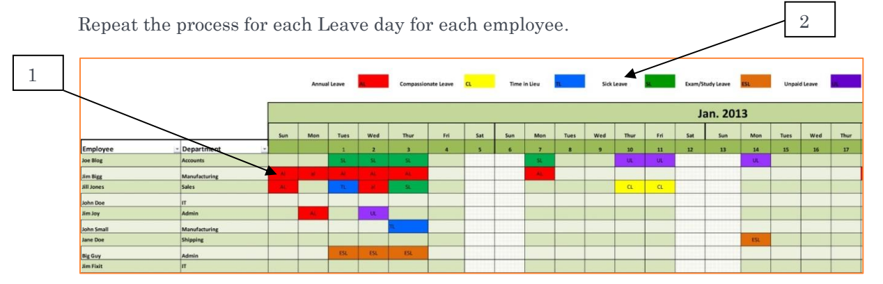
Figure 5 Entering Leave Details

The cell color is automatically changed and the monthly and annual totals for the Leave Category are updated.