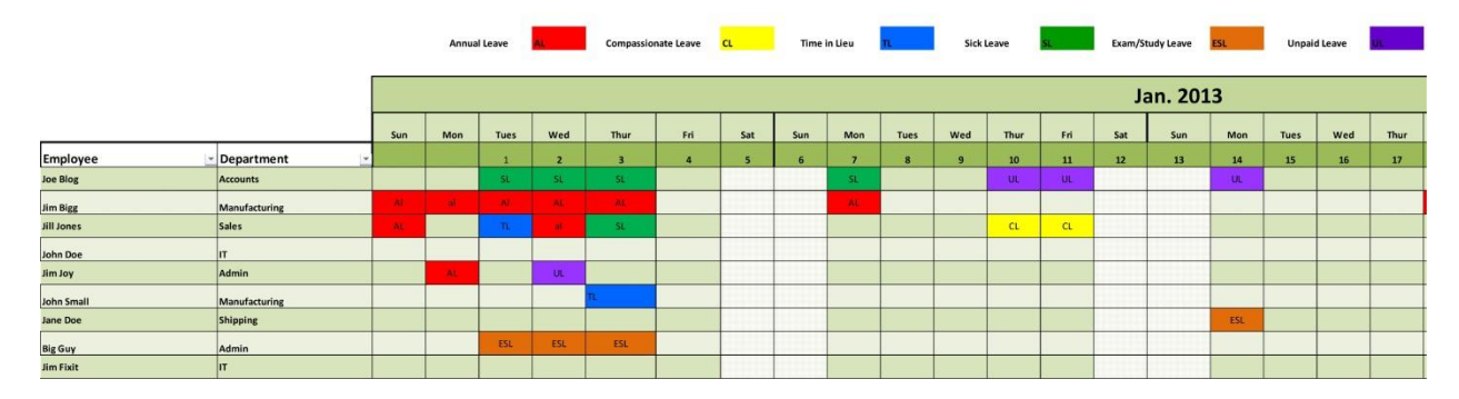
Figure 1 Monthly Schedule Excel Template

This Excel-based template provides a detailed leave management schedule template for each month of year. A monthly and annual summary report is also produced. The template uses any month of the year as a starting position and is automatically updated for future years. The Excel template is totally customizable, uses only standard Excel features and contains no macros. The typical monthly calendar is depicted in Figure 1 below. The Annual Summary Report is depicted in figure 2 below.