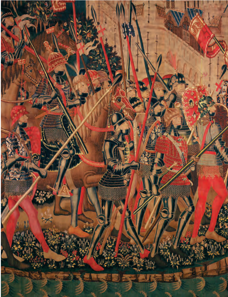
Religious Wars Portuguese troops storm Tangiers in Morocco in 1471 as part of the ongoing struggle between Christianity and Islam in the mid-fifteenth century Mediterranean world. Why would such an image be produced?

Italy and spreading northward through Europe, the Renaissance peaked in the late fifteenth century.