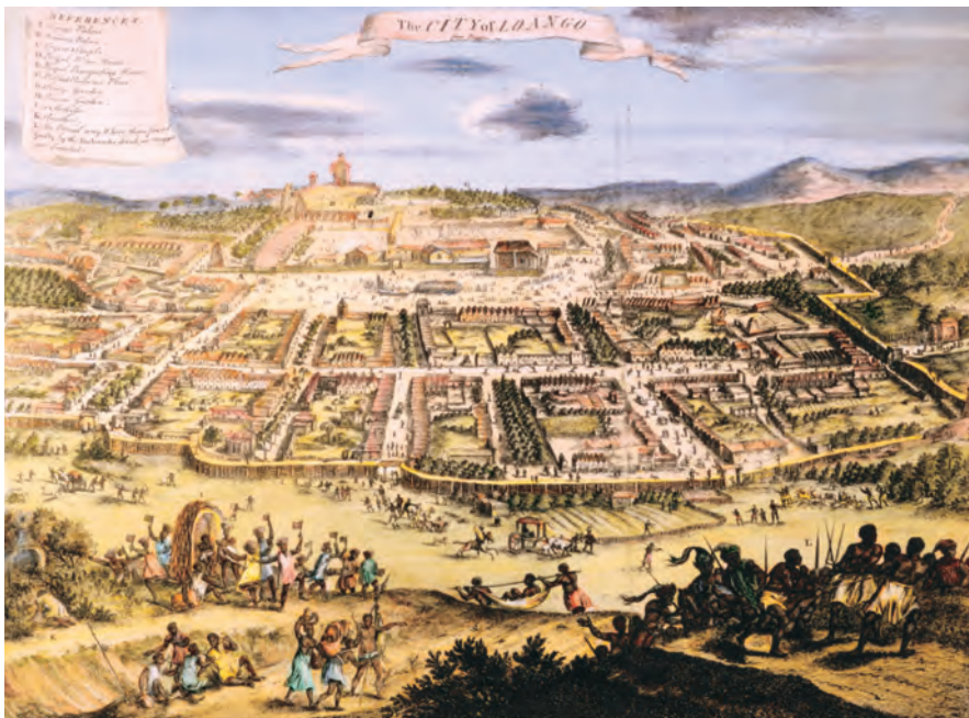
The African City of Loango The city of Loango, at the mouth of the Kongo River on the west coast of Africa, was larger at the time of this drawing in the mid-eighteenth century than all but a few seaports in the British colonies in North America. How does it compare to the Anasazi village ruins shown earlier?

The kingdom of Benin, which would become important in the English slave trade, formed in about 1000 C.E. west of the Niger Delta. When Europeans