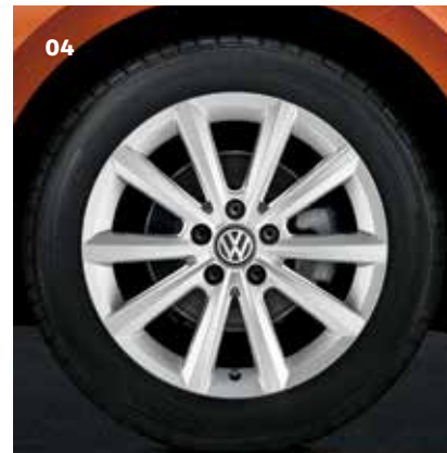
04 Merano, alloy wheel 16", brilliant silver Part. no. 2G00714968Z8 (Not for GTI)