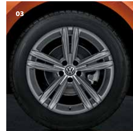
03 Sebring alloy wheel 16", grey metallic Part. no. 2G0071496AZ49 (Not for GTI)