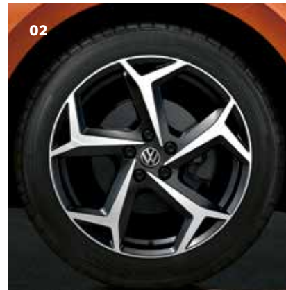
02 Bonneville, alloy wheel 17", black gloss machined Part. no. 2G0071497FZZ