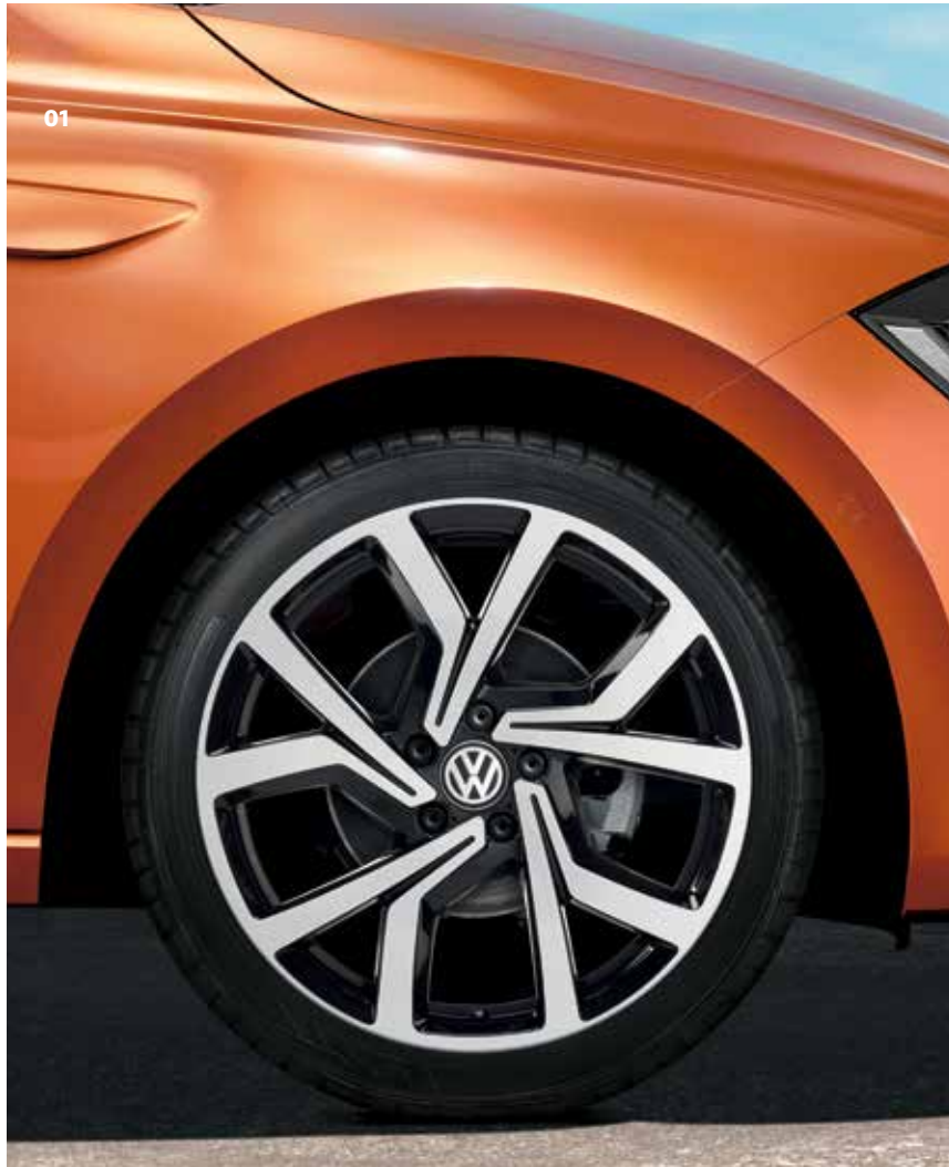
01 Brescia, alloy wheel 18", black gloss machined Part. no. 2G0071498FZZ