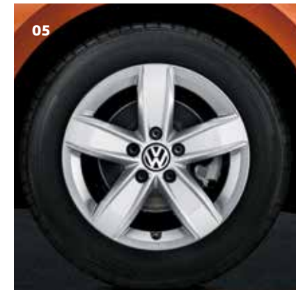
05 Corvara, alloy wheel 15", brilliant silver Part. no. 2G00714958Z8 (Not for GTI)