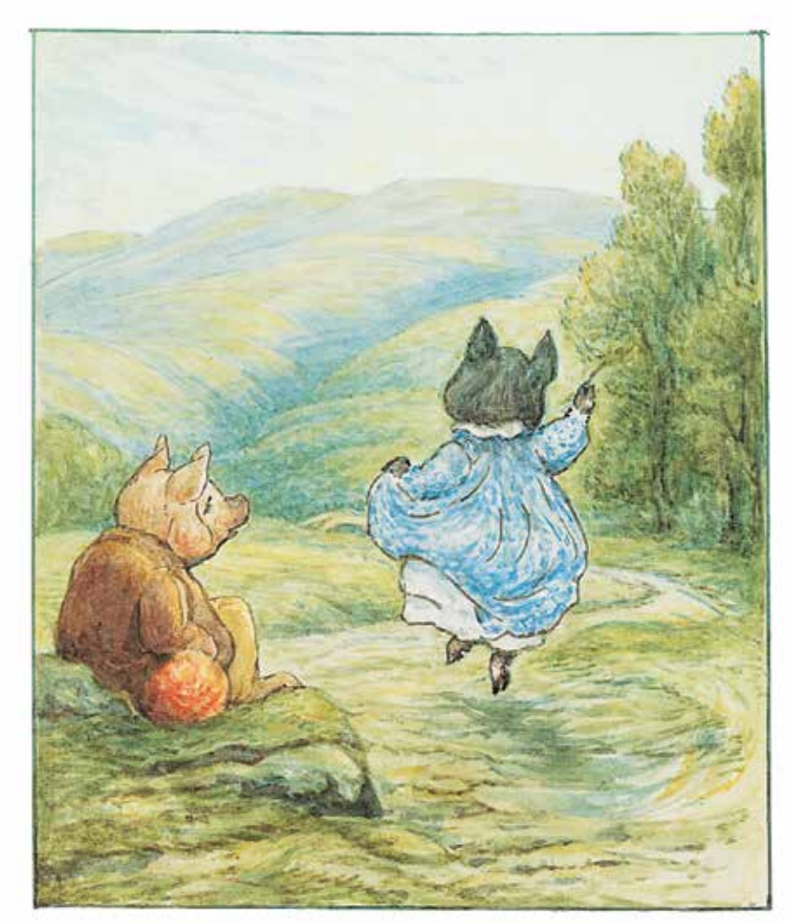
Piggling Bland and Pig-wig