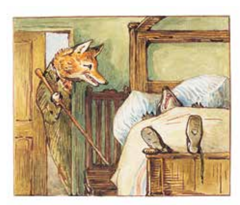
Tommy Brock snoring in Mr. Tod's bed