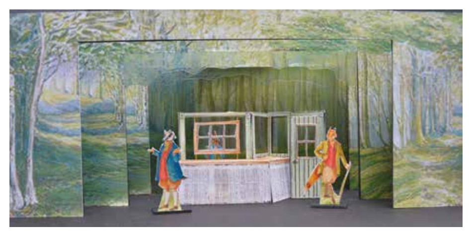
Set model of Mr. Tod's house.

In its home city, Enchantment has reached audiences of about 20,000 per year through its innovative and imaginative presentations of literary classics for children. Its newest program, Enchantment Everywhere, was started in the spring of 2014, and takes completely portable productions directly into school auditoriums, community centers and local venues - anywhere children and families gather - providing free tickets to thousands of children. On tour across the United States each year, the Company reaches more than 150,000 people in 35-40 states. Based on extensive experience, about 80% of the Company's touring audience is comprised of children from 5-12 who delight in the company's fantastic life-size puppets, skilled masked actors, original music, and startling feats of magic and illusion. It is to their infectious laughs, astonished gasps, and enthusiastic applause that Enchantment is dedicated.