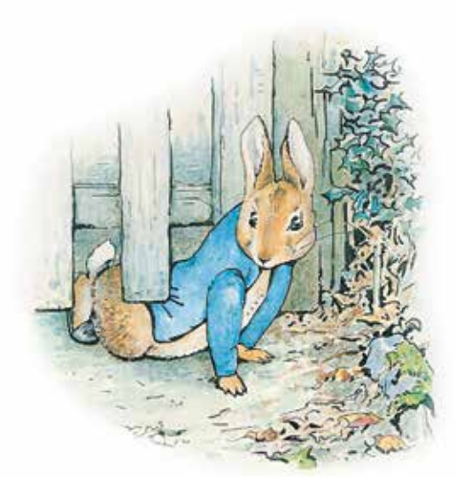
Peter sneaking into the garden