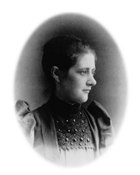
Picture of Beatrix Potter