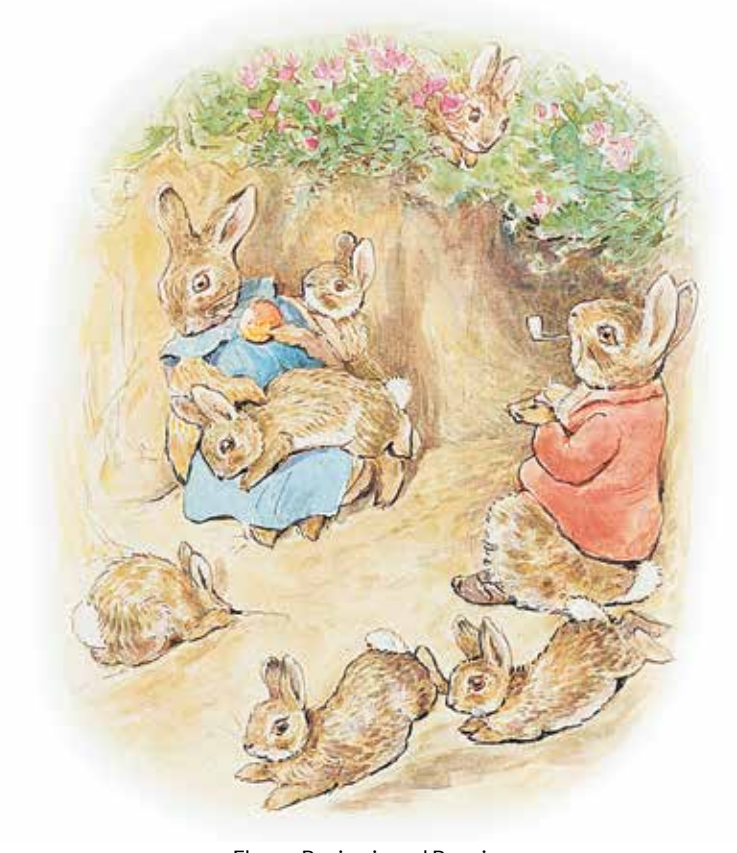
Flopsy, Benjamin and Bunnies

Appreciation: Applause is the best way for an audience in a theater to share its enthusiasm and to appreciate the performers. At the end of the program, it's customary to continue clapping until the curtain drops or the lights on stage go dark. During the curtain call, the performers bow to show their appreciation to the audience. If you really enjoyed the performance, you might even thank the artists with a standing ovation!