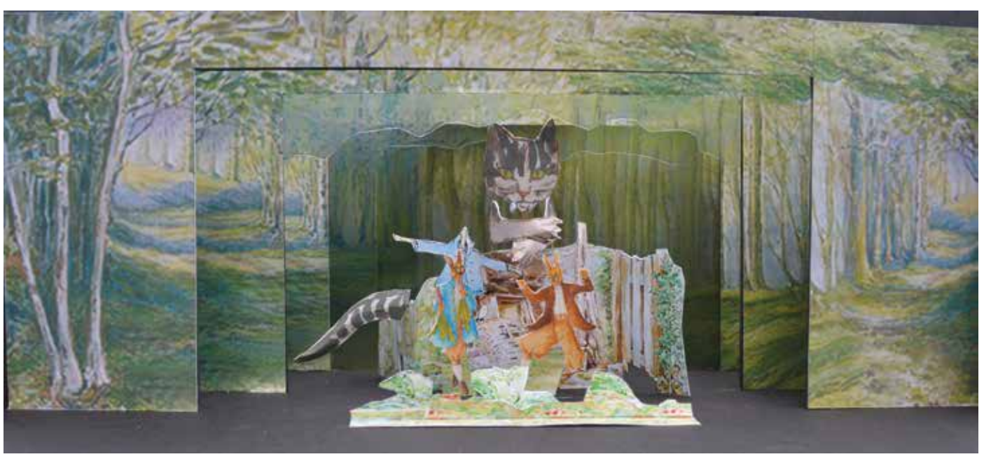
Set model of Mr. McGregor's garden.

Puppets are similar to the mask in their fascination and power. We accept that this carved being is real and alive, and we invest it with an intensified life of our own imagining. Thus, puppets can take an audience further and deeper into what is true. Audiences bring more of themselves to mask and puppet theater because they are required to imagine more. Masks and puppets live in a world of heightened reality. Used with art and skill, they can free the actor and the audience from what is ordinary and mundane, and help theater do what it does at its best: expand boundaries, free the imagination, inspire dreams, transform possibilities, and teach us about ourselves.