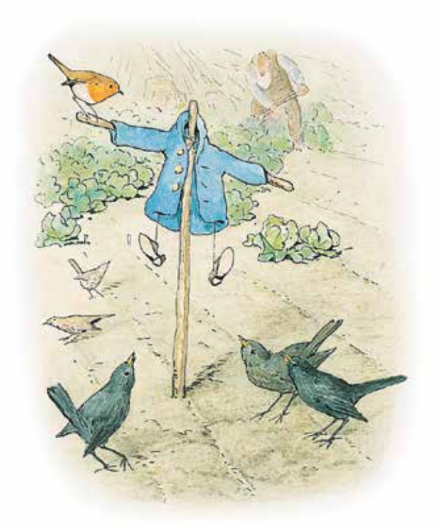
Peter's jacket on the scarecrow