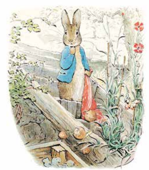
Peter Rabbit in Mr. McGregor's garden

At the beginning of the play, we meet the characters in our story: Peter Rabbit is grown-up and has his own garden. Peter is easily frightened and avoids anything that smacks of danger or adventure.