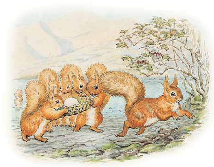
Squirrel Nutkin and friends