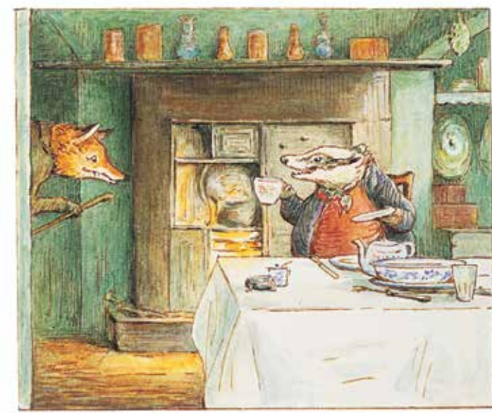
Mr. Tod and Tommy Brock