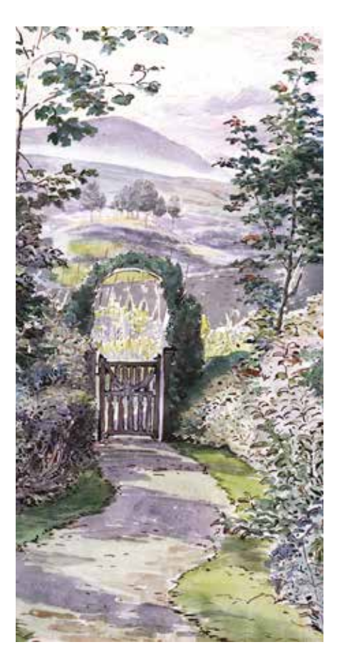
The Garden at Little Ees Wyke, painted by Beatrix Potter in 1902.