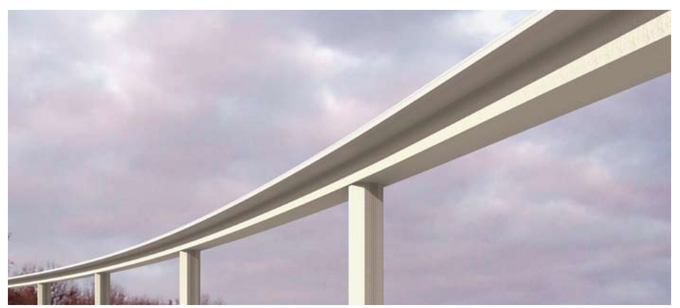
Comprising a total of seven approach spans, the bridge's total length is 2975 ft. Illustration: T.Y. Lin International.