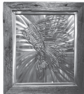
NEW! Weld Art by Gary Thibodeau

Original Fine Art Silks & Weaving Soaps/Candles Cutting Boards Needle Felting Custom Mirrors Jewelry Boxes