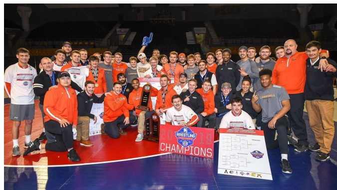
Campbell just edged out Appalachian State for the 2019 SoCon Wrestling Championship title.