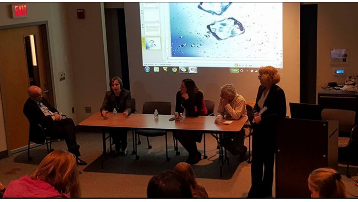
2nd Annual Seminar on Statistical Practice, April 15. The speakers presented the statistical applications of their work. Topics included modeling climate change, estimating potential losses from natural catastrophes, the use of statistical analyses in forensic science, and fetal screening and maternal monitoring methods.

The work and activities of BUSCASA complement those of the Biostatistics Student Association ( BSA ), which continues its active educational and social presence for all Biostatistics students at BU. Find their events and updates <u>here</u>.