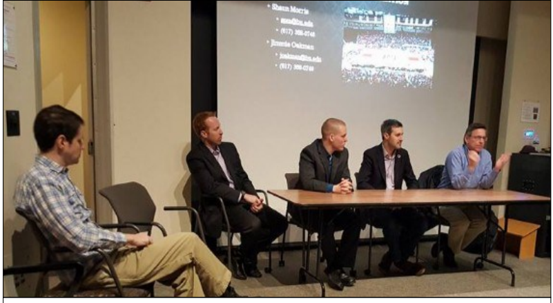
BUSCASA Seminar on Sports Statistics, April 2016, with guest speakers from the Boston Celtics, Boston Red Sox, and BU basketball.

Throughout the year, BUSCASA hosts a variety of events that introduce students to different fields of statistics, build upon analytic and programming skills, and provide networking opportunities with ac-